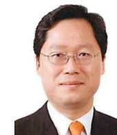
Chang Kyu Kim, Minister Counselor for Trade, Industry and Energy, Embassy of the Republic of Korea in the U.S.