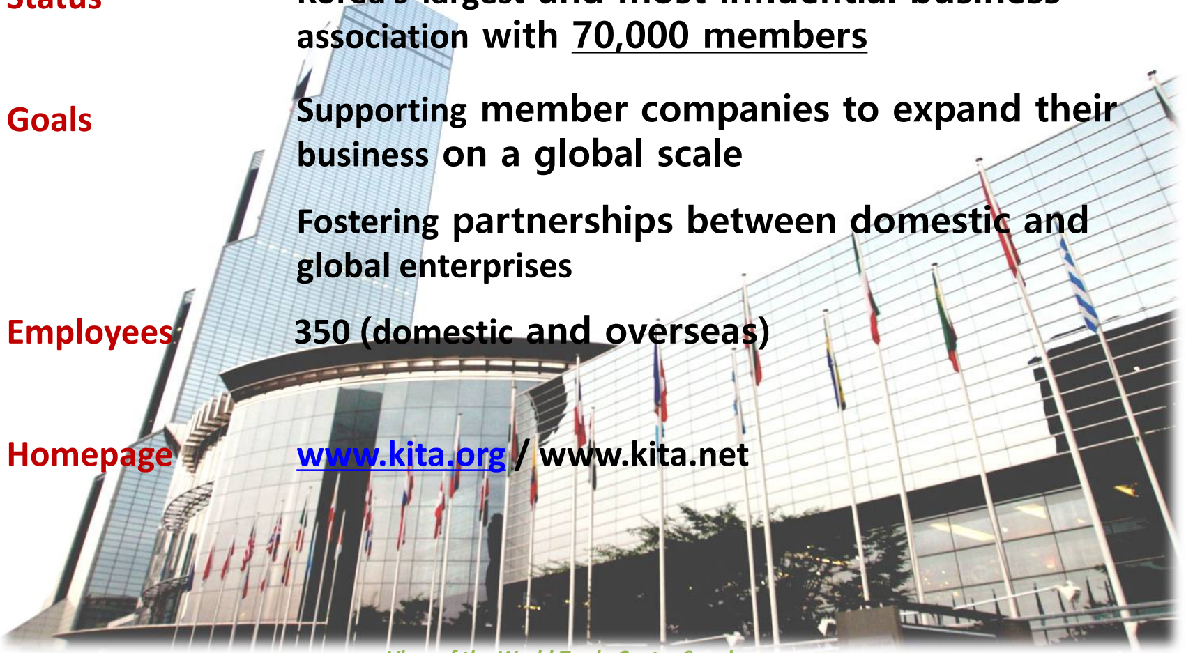
View of the World Trade Center Seoul