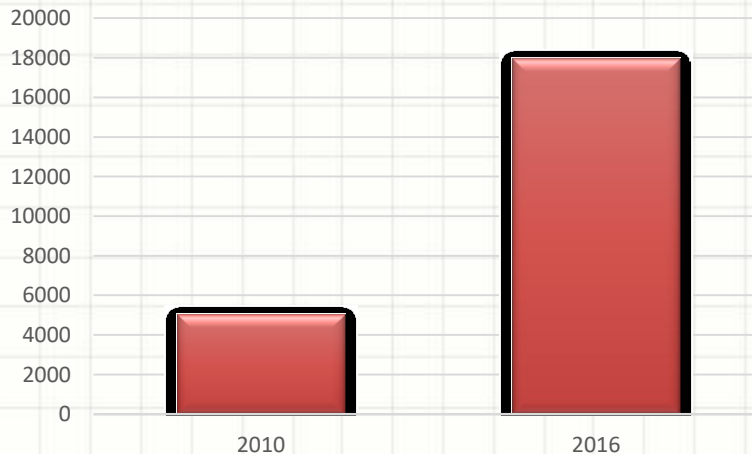
Korea FDI to U.S.